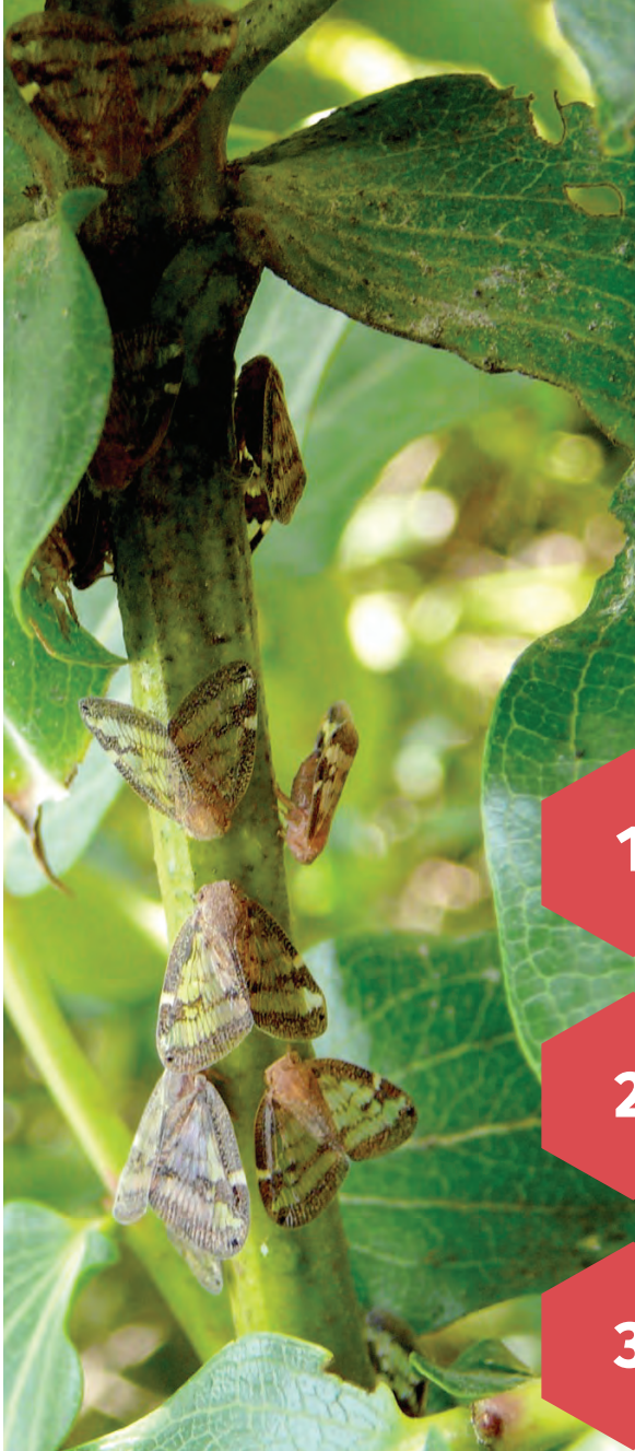
Passion vine hoppers on tutu bushes